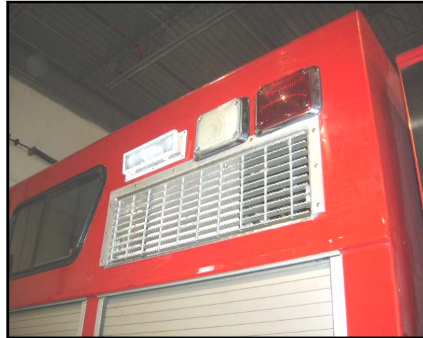
Side-body, fresh air intake