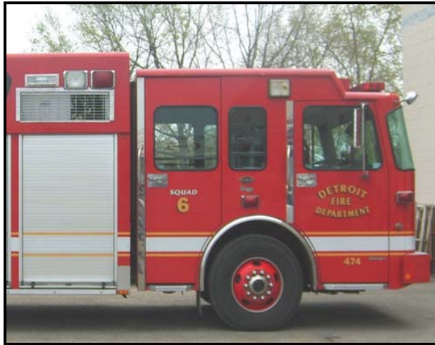
Detroit squad vehicle

High performance Hydraulic Generators replace direct drive systems