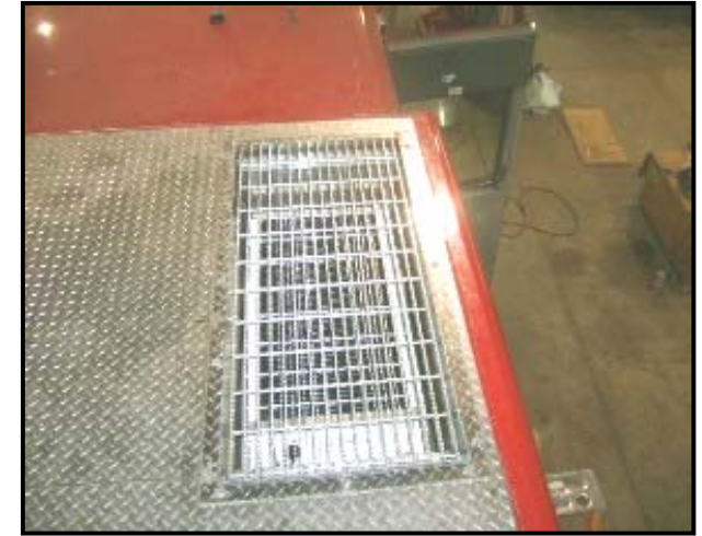
Top, hot air exhaust (through walking grate)